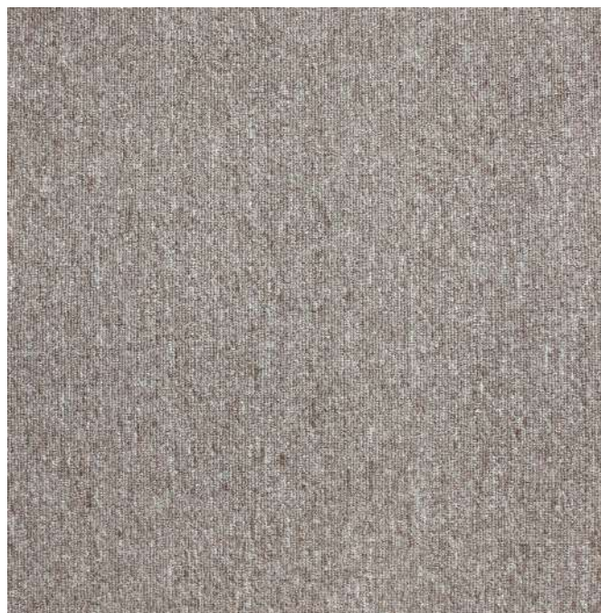
SOLAR 7402 BEIGE