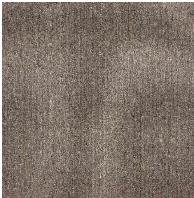
SOLAR 7401 BROWN