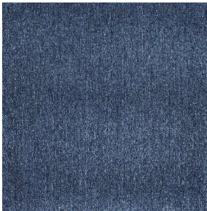
SOLAR 7502 DARK BLUE