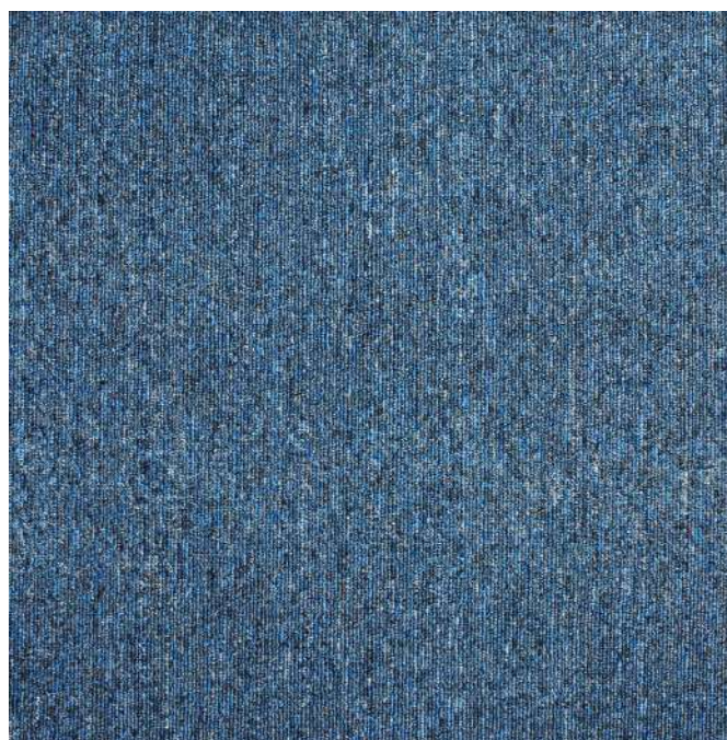
SOLAR 7501 SKY