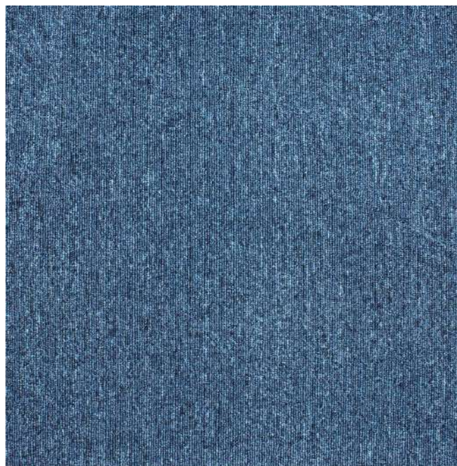
SOLAR 7503 OCEAN