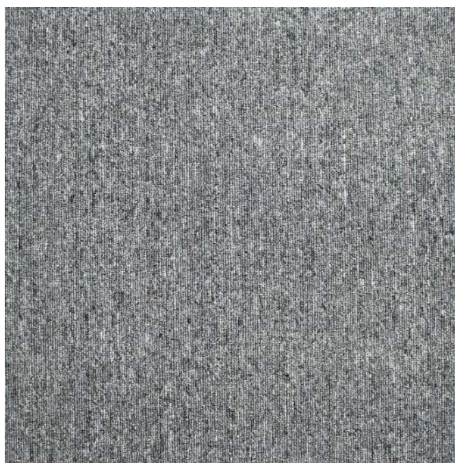
SOLAR 7701 GREY