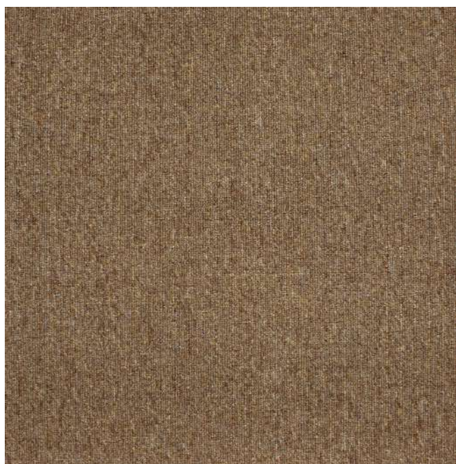
SOLAR 7403 GOLD