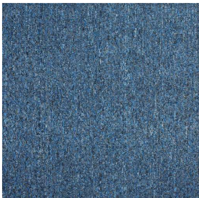
IMPULSE 84 SKY BLUE