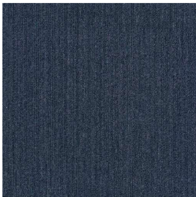
IMPULSE 85 DARK BLUE