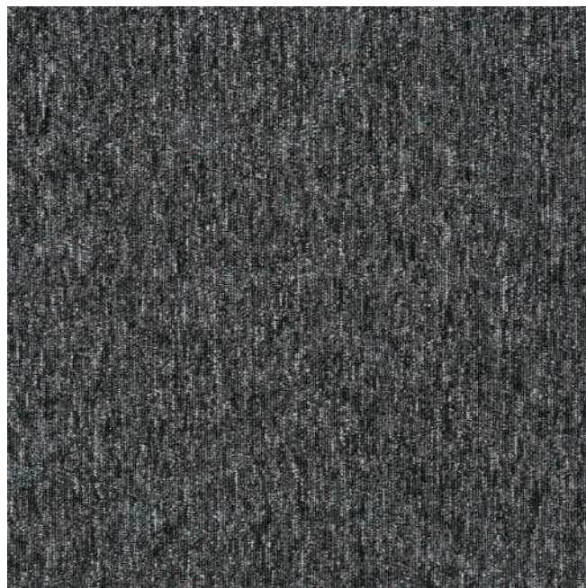
IMPULSE 88 CHARCOAL GREY