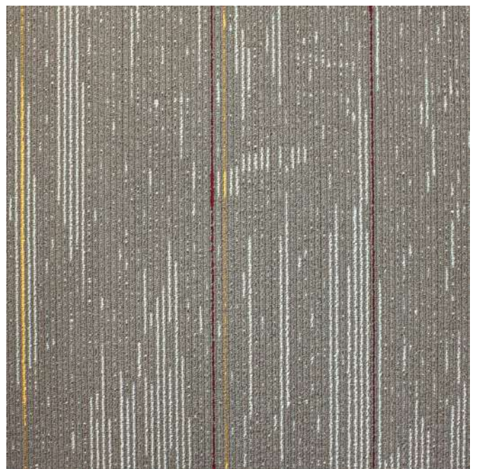
ORION 5795 REED