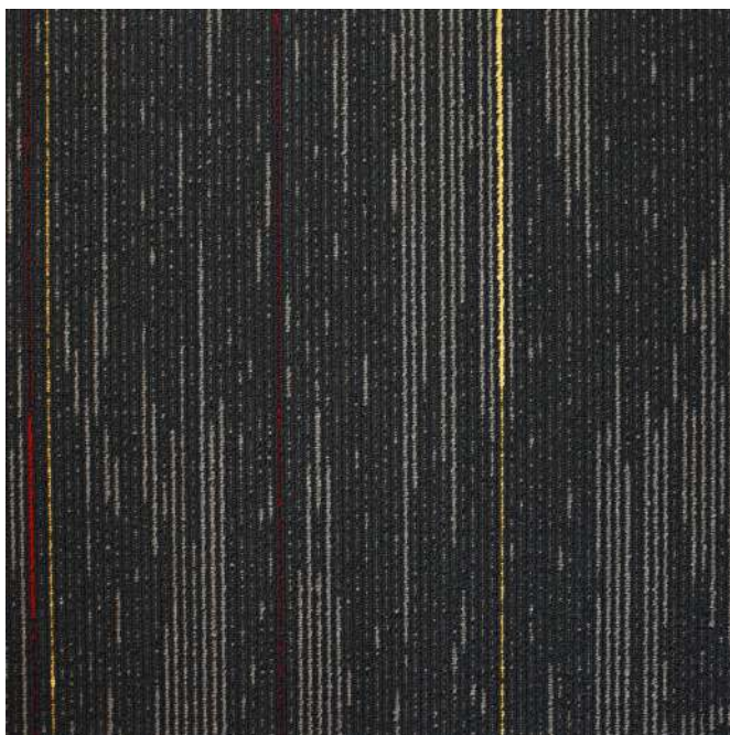
ORION 5777 ACACIA