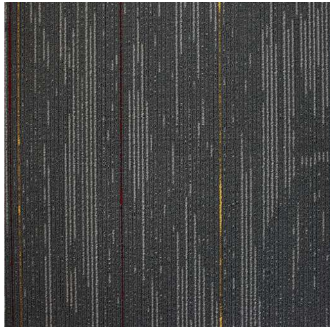
ORION 5774 IVY