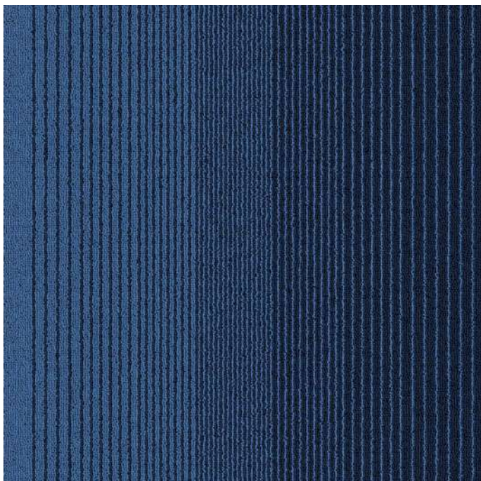
AMBITION 8555 - MIDNIGHT BLUE