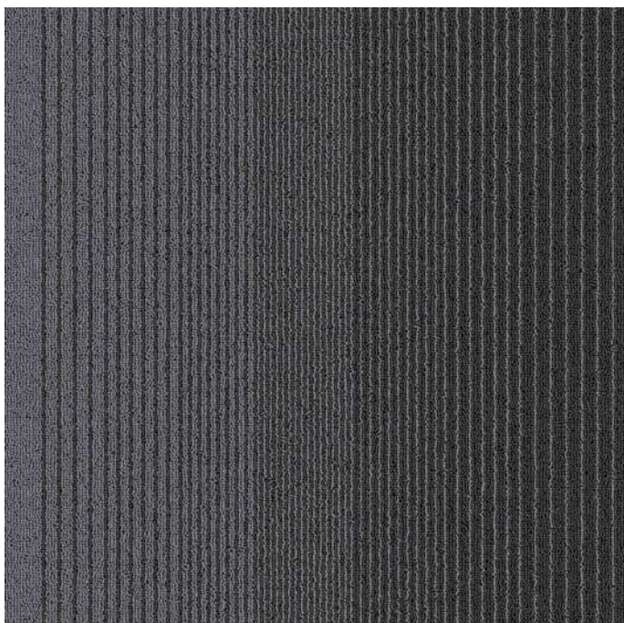
AMBITION 8577 - LIVID