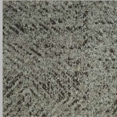
EROS CHOCOLATE - 503