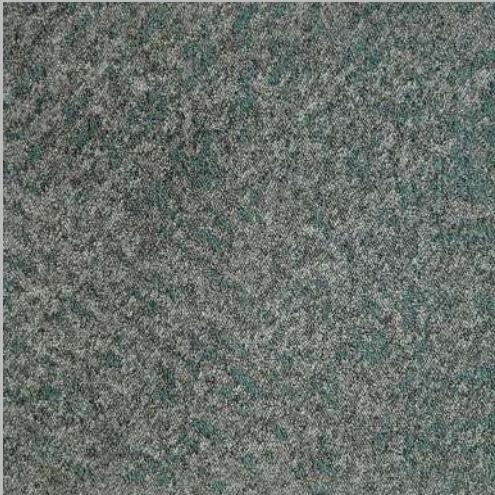
EROS AQUA - 505