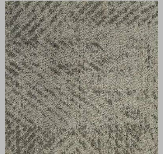
EROS SMOKEY - 504