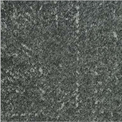
EROS SPLINTER - 501