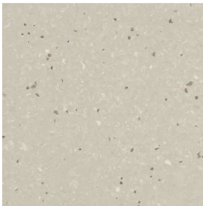
MEDITIME 654 BEIGE