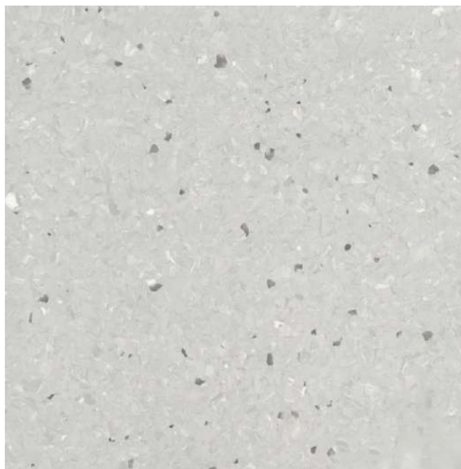
MEDITIME 611 LIGHT GREY