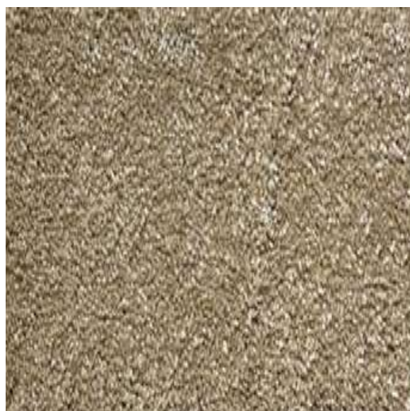
MJ 673 - HONEY