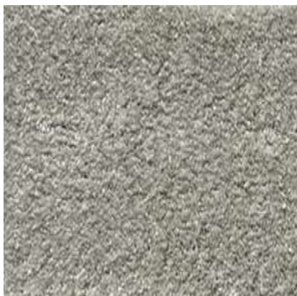
MJ 672 - STEEL GREY