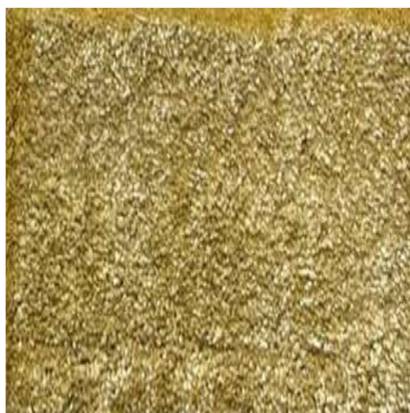
MJ 611 - GOLD