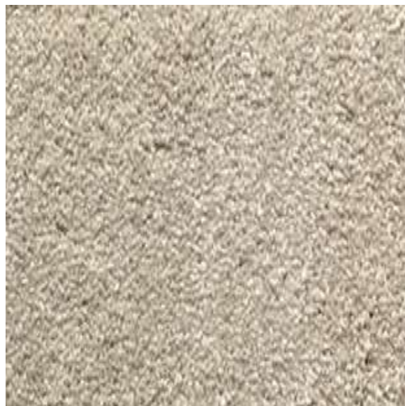
MJ 627 - BEIGE