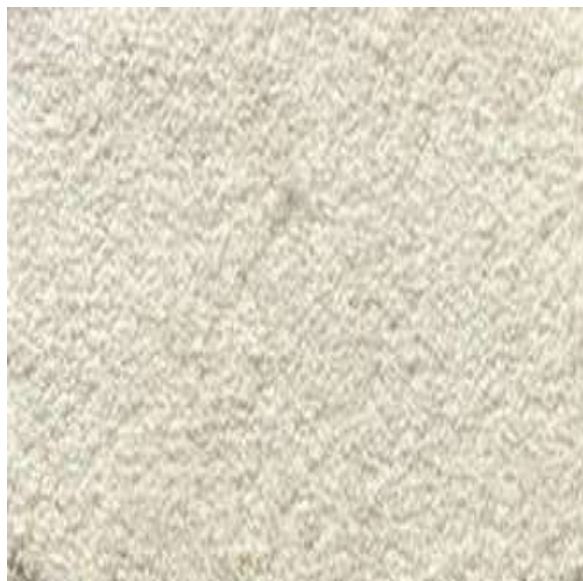
MJ 670 - IVORY