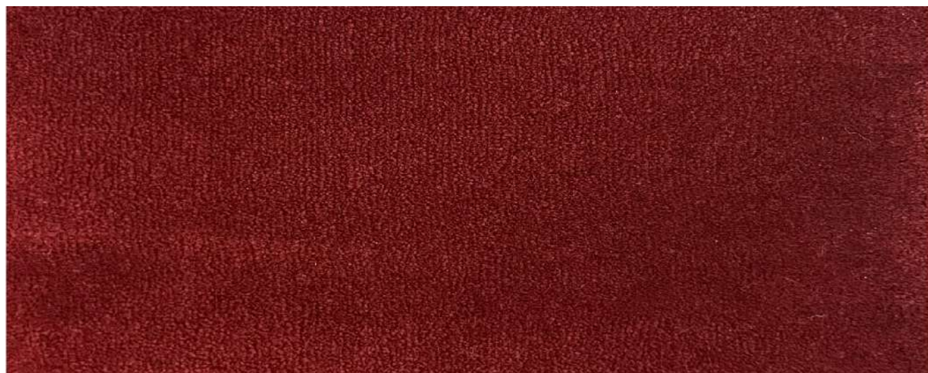
MH 705 - CRIMSON RED