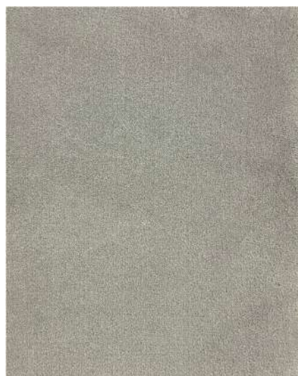
MH 756 METAL GREY