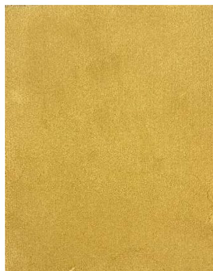
MH 711 DESERT SAND