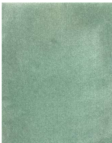
MH 755 SEA GREEN