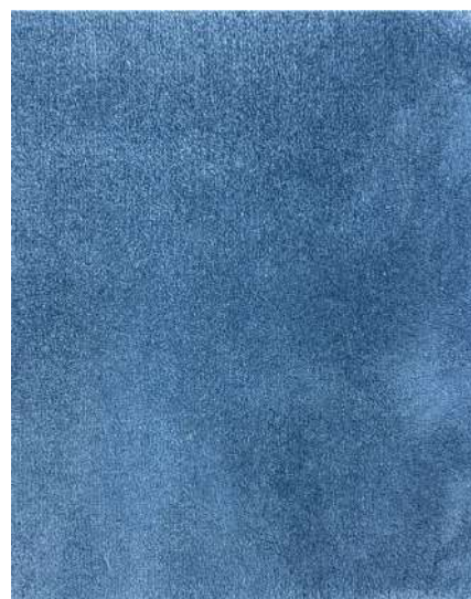
MH 754 DENIM BLUE