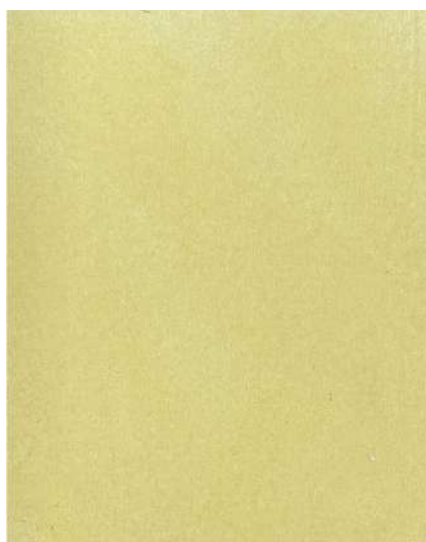
MH 710 VANILA CREAM