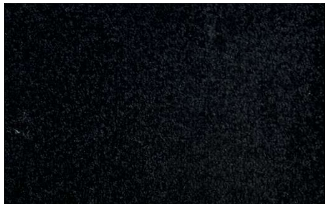
VLNT 2728 BLACK