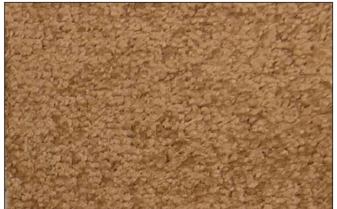
VLNT 2415 COFFEE