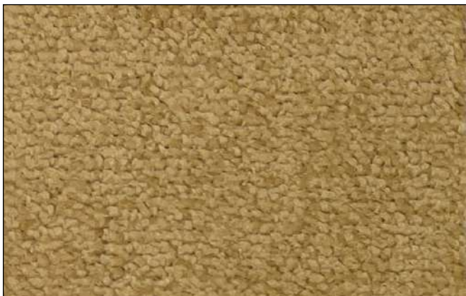
VLNT 2921 CAMEL