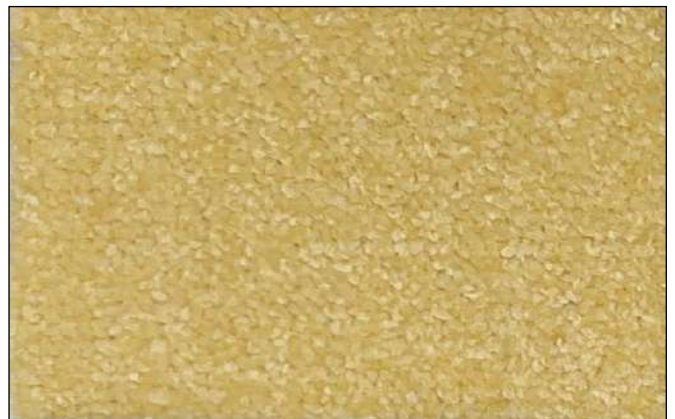
VLNT 2329 GOLD