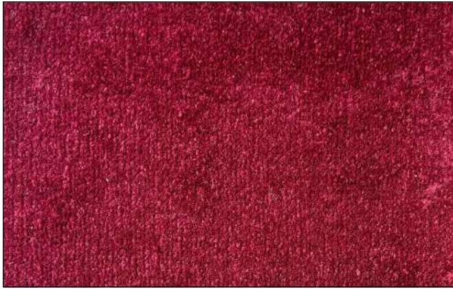
VLNT 2216 MAROON