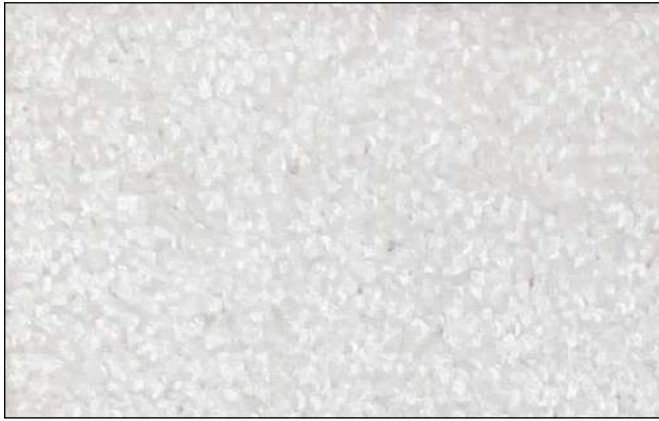
VLNT 2053 WHITE