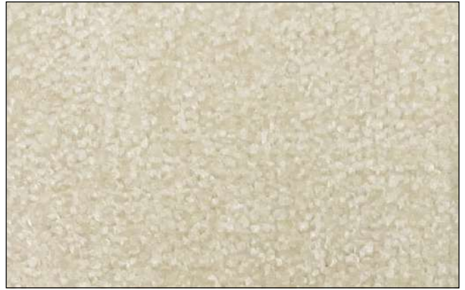
VLNT 2322 OFF WHITE