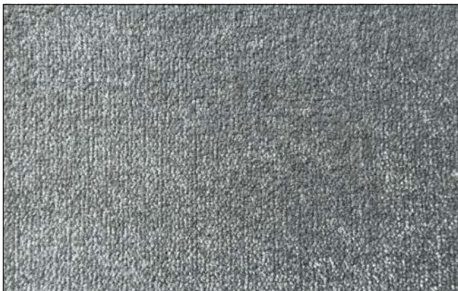
VLNT 2723 LIGHT GREY