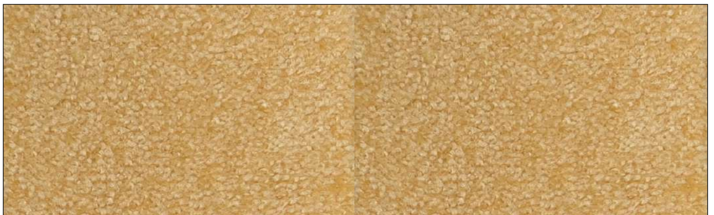
VLNT 2448 PEACH