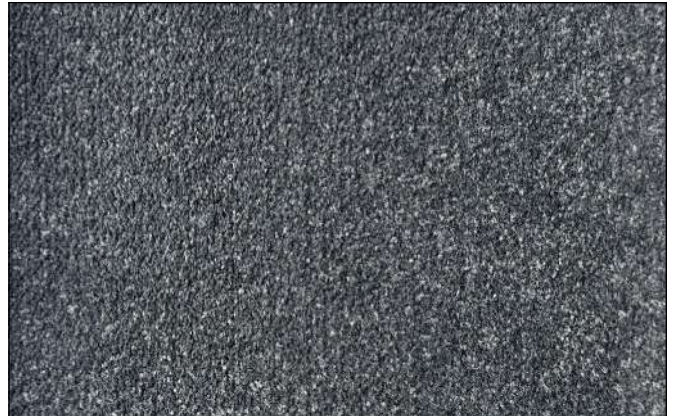
VLNT 2084 DARK GREY