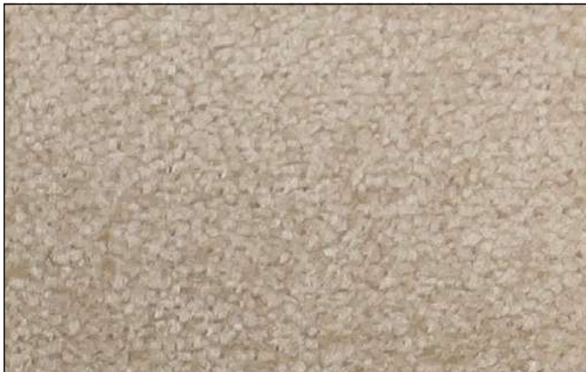
VLNT 2424 BEIGE