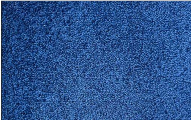
VLNT 2514 DARK BLUE